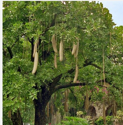
Kigelia pinnata “sausage tree”