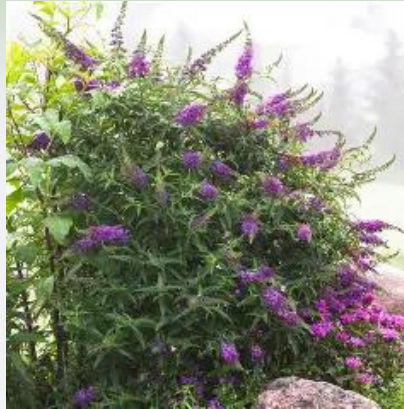
Buddleja davidii “butterfly bush” www.thesill.com